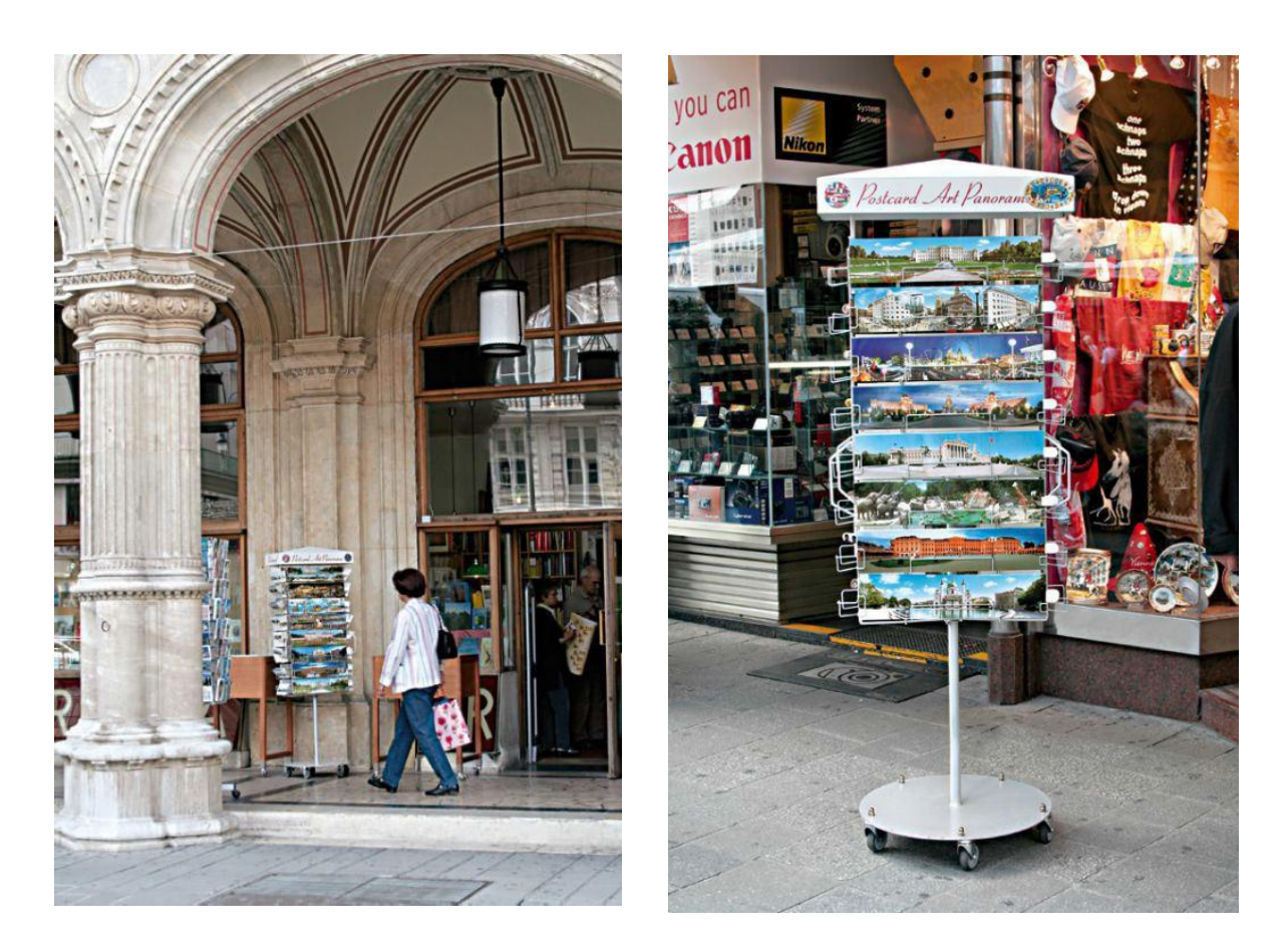
Panoramic-Postcard rack for the sales presentation can only be positioned at Shops in prime location. Namely exactly where they would be considered by tourists from all over the world

Mapa Verlag Publisher has saved already in 2004 design protection rights for the European Union for the monopolistic acquired sole production of panoramic postcards with the described design.